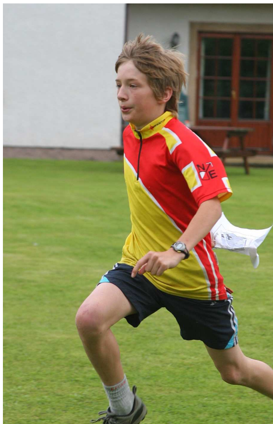
Sprint orienteering during the recent NEJS training camp in the Trossachs. See pages 5/6 for full report.