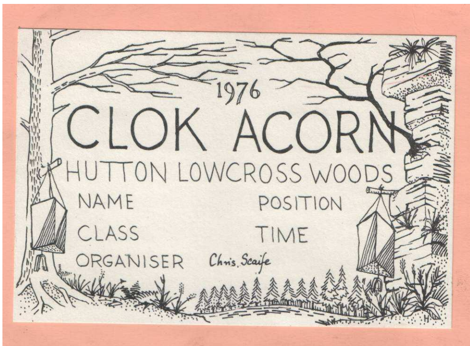
Certificate from the CLOK Acorn Event in 1976 – this year the event returned in 2010 on a revised and newly extended Cringle map