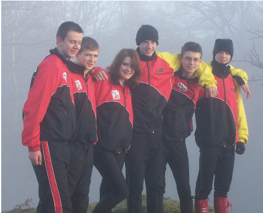
NEJS juniors (mostly CLOK!) enjoying the wintry conditions at Lakeside 2008 training.